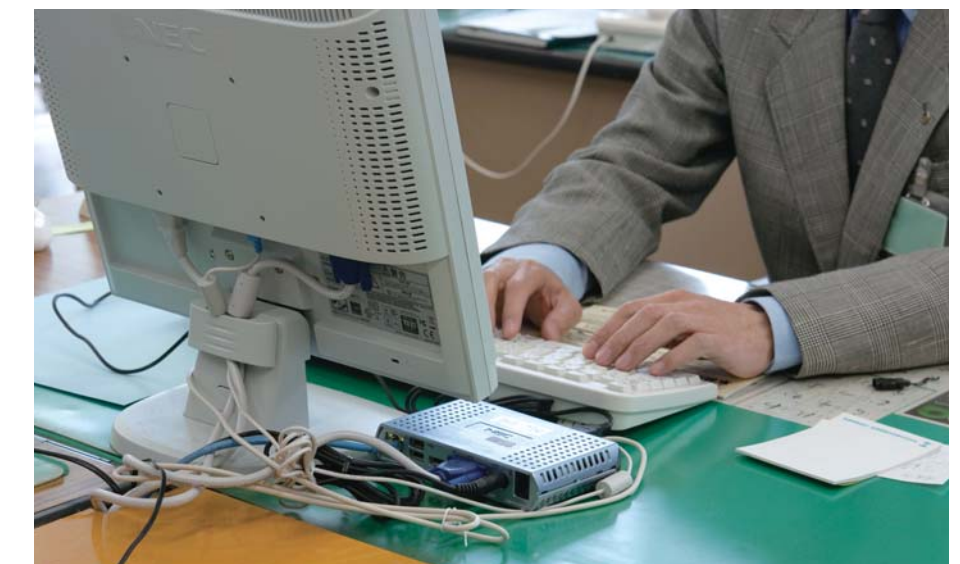
A palm-sized thin client terminal "US110" with a high-speed video/audio processing capability